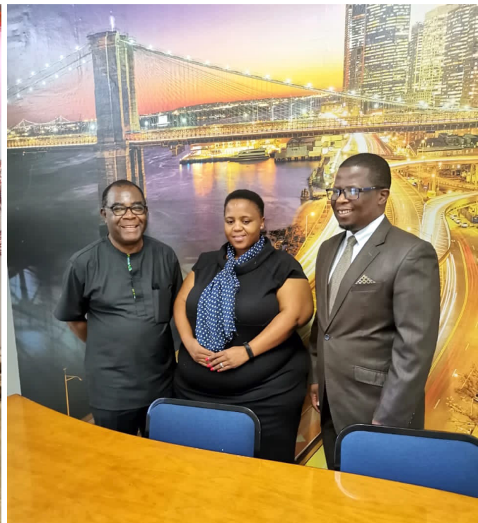
Visit to Kgolagano college, Botswana