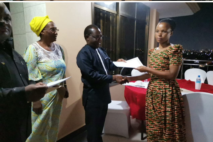
Top: Group discussions at the Dar es Salaam workshop. Below: A participant receives a certificate after the workshop