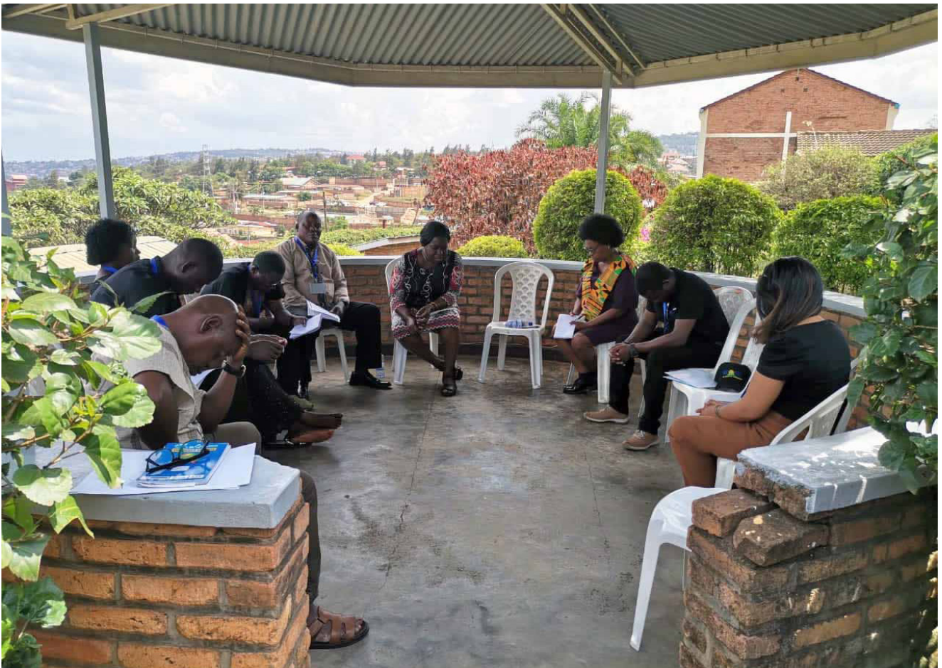
Participants take a moment to commit group deliberations unto the Lord during the AATEEA 5 th Quadrennial Conference.

Mozambique, Ethiopia, Malawi, Tanzania, Ghana, Rwanda, Uganda, Botswana, Switzerland, and Great Britain.