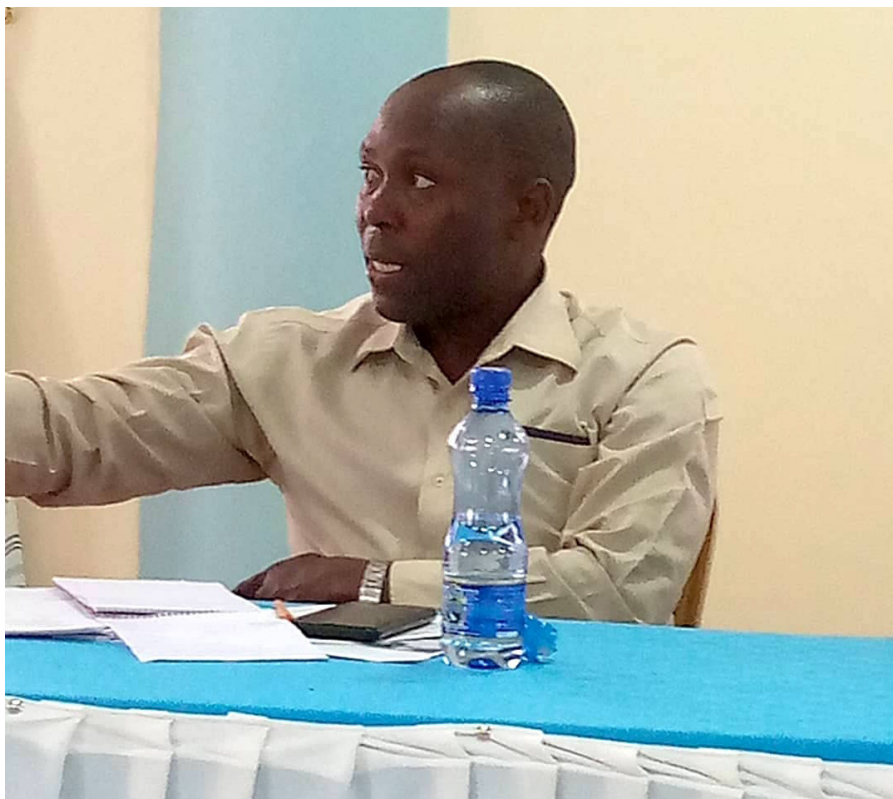
Participant making a contribution

This was held in Nairobi, from 19 to 23 September 2022, as a follow up of the EDL to further prepare the EDL graduates to practically pass on the skill of transformative leadership to as many in their local church and community. The workshop was attended by 5 EDL graduates, 2 AATEEA staff, and 9 facilitators.