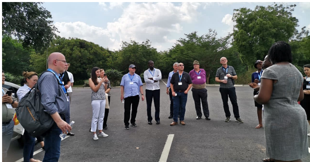
Exposure during Consultation on Theological Education and Pandemic.