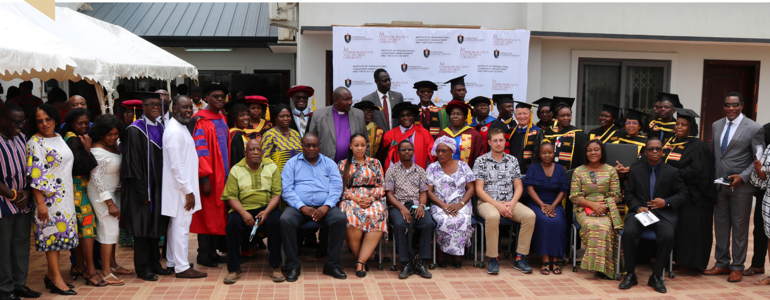
EDL Graduates with ILU staff, AATEEA Executive Committee, and Resource persons

Having successfully concluded the first EDL with a colourful graduation and successfully followed up with a mentoring and LEE orientation, it was time to launch the second EDL class in July 2022.