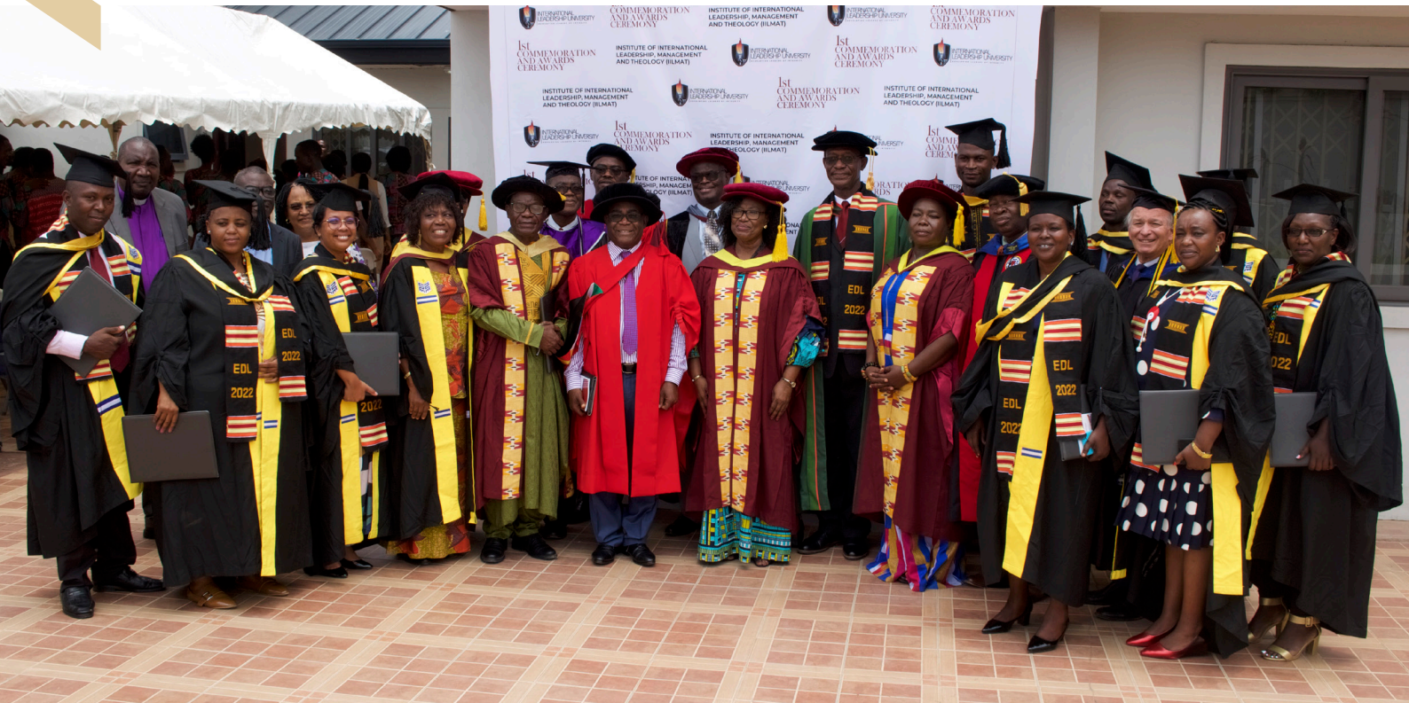
EDL Graduates with ILU staff and AATEEA Executive Members

In a bid to respond to the need for trained transformative leaders, AATEEA embarked on the Executive Diploma in Leadership facilitated by the International Leadership University, Ghana Campus. This was to be a face to face Nine Months training program. But just before