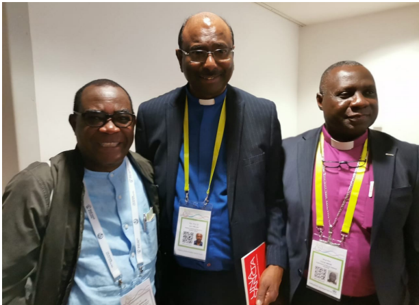
AATEEA General Secretary (L) poses with WCC incoming General Secretary (M) and OAIC Chairperson (R) after the Global Christian Forum (GCF) session at the WCC General Assembly.