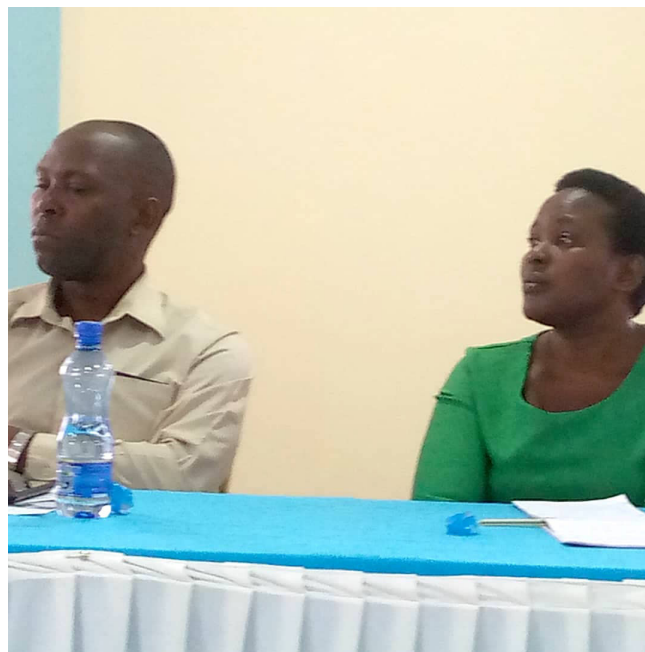
Participants from Mozambique and Rwanda listening attentively