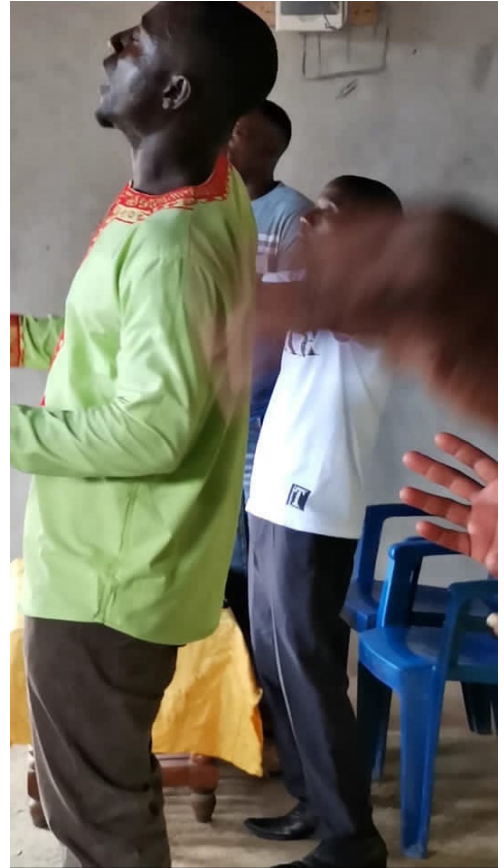
TEE Visit Free Methodist Church, Dar es Salaam