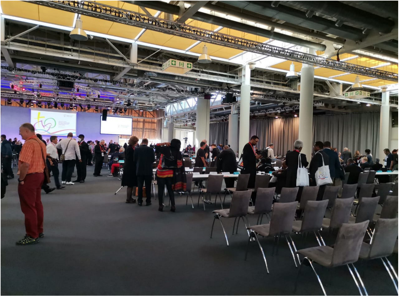
End of a plenary session at the WCC Assembly