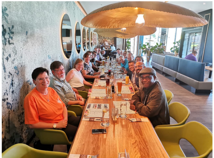
Weekend exposure group at WCC Assembly.