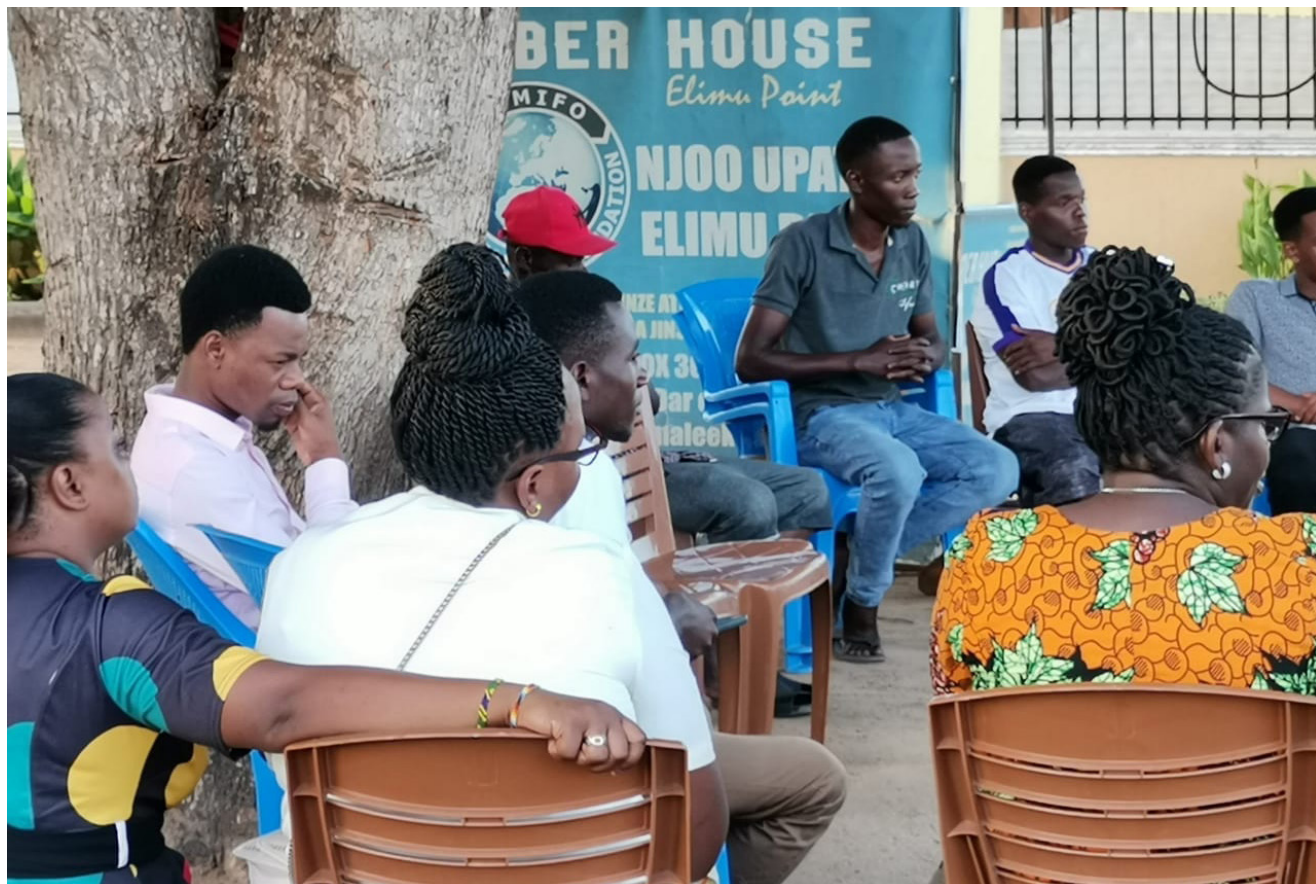
Presentation by reformed drug addicts during exposure at Dar es Salaam Prison Tutors Workshop