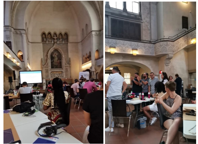
WSCF General Assembly.