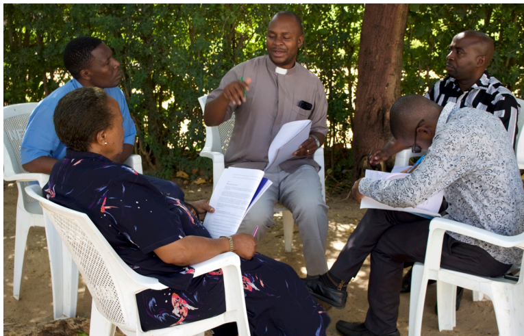
Engaging group discussions at Tanga Prison Tutors Workshop