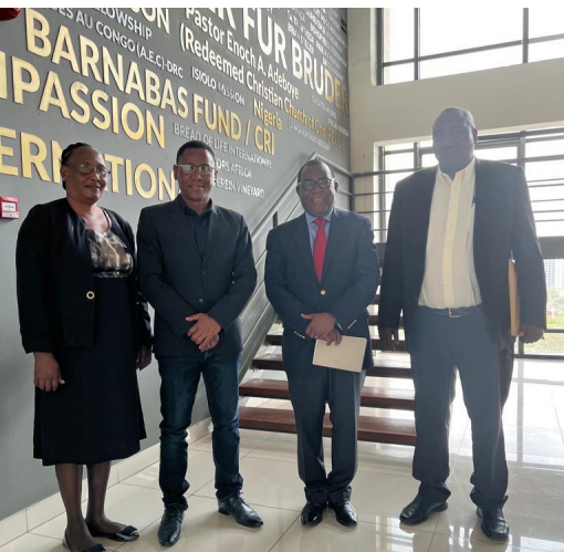
The officers and the General Secretary visit the General Secretary of the Association of Evangelicals in Africa (Second from left).