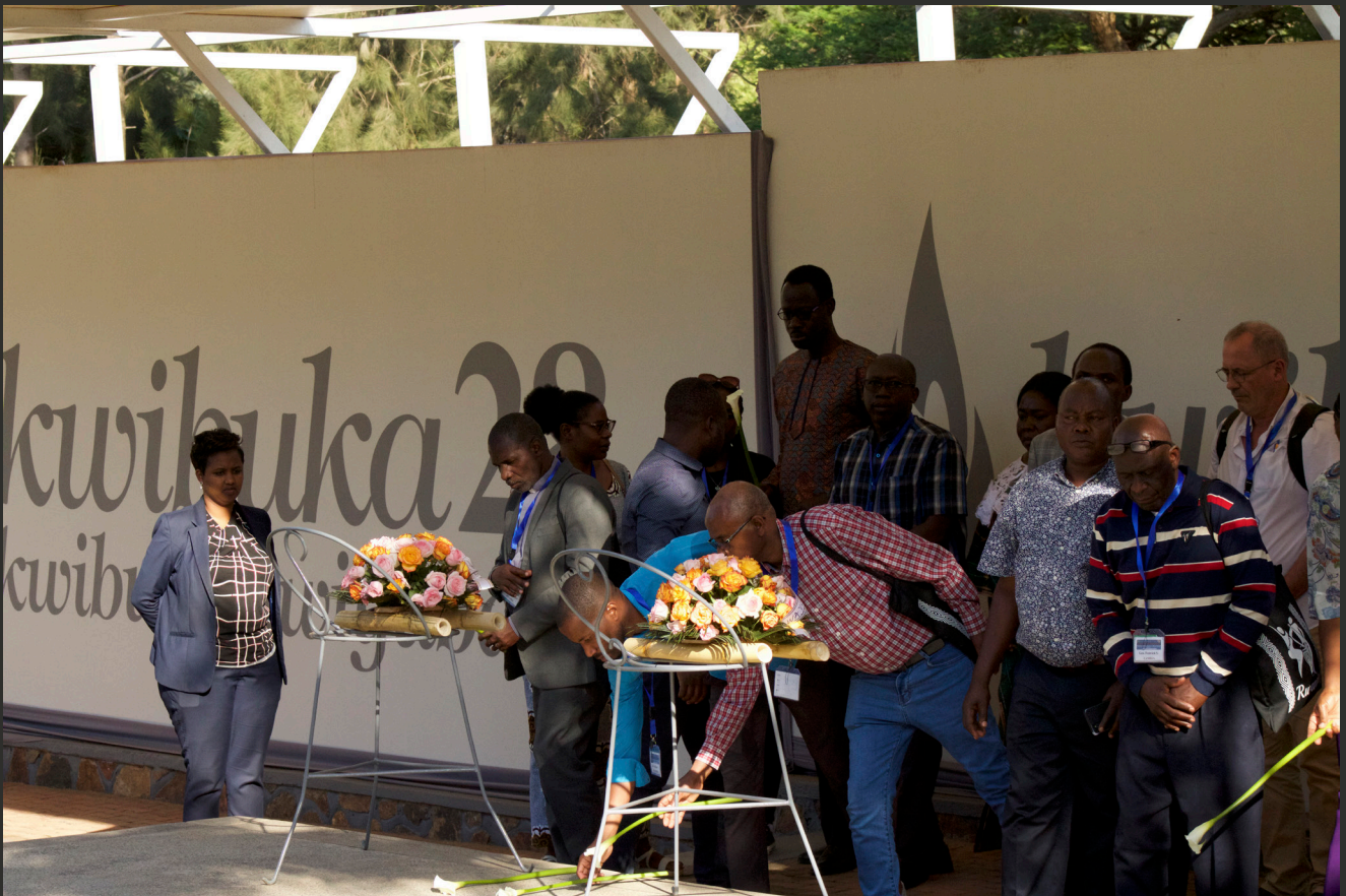
AATEEA Conference Participants Laying Wreaths At the Rwanda Genocide Memorial.

prisoners into useful citizens". May His Soul Rest In Eternal Peace.