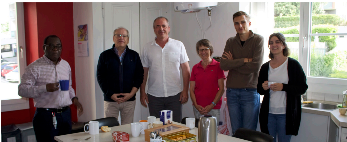
Meeting with DM staff