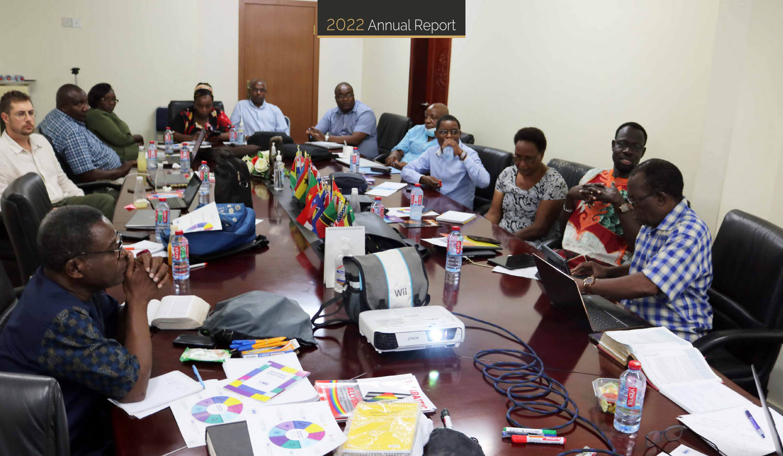
An Engaging Session during Building Inclusive Communities Consultation